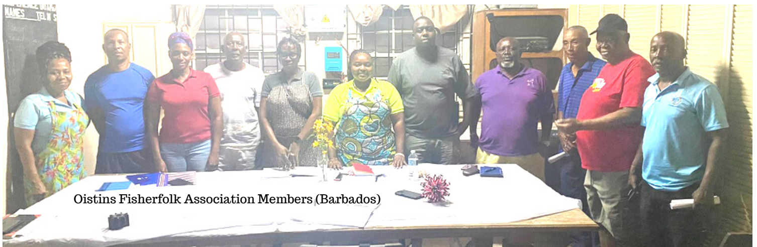
Oistins Fisherfolk Association Members (Barbados)

ANNOUNCING THE ANNUAL GENERAL MEETING OF BARNUFO