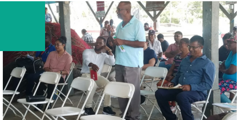
Guyana fishers meeting 2022 on concerns of the proposed gas to shore pipeline. Concerns were received by Exxon Mobil

Agri-Investment Forum and Expo to be held in Guyana from May 19-21 under the theme 'Investing in Vision 25 by 25' which is to consider reducing the region's annual food import bill. Fishers can play a role in sustainably increasing production and/or developing new fisheries to reduce imports.