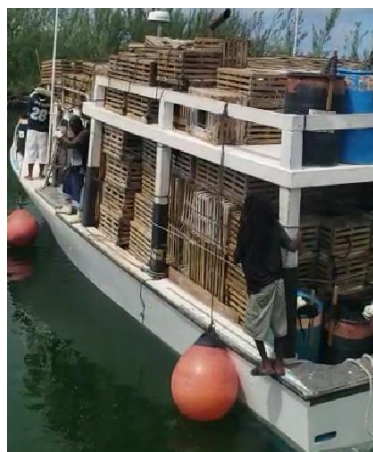
A fishing vessel heading out to sea to drop lobster traps ahead of the lobster season.

The Bahamas spiny lobster ( Panulirus argus ) season opens on August 1 st and runs through to March 31 st . Since August 2018 the Bahamas Lobster fishery has become the first Caribbean fishery to receive certification of the Marine Stewardship Council (MSC) programme.