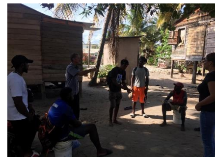
Hopkins, Belize Fisherfolks being consulted on Gillnets

Prohibiting gillnet fisheries will result in a net loss to the Belize economy, public health, community dignity and food sovereignty. The only winners would be those that are not directly impacted, such as NGOs and tourism interests, as they would satisfy foreign-derived objectives and remove the gillnet fishers from the marine/aquatic space.