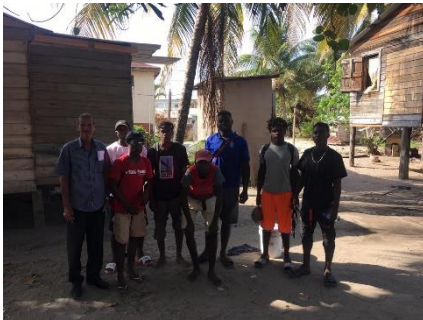
Hopkins, Belize Fisherfolks, 21 st May